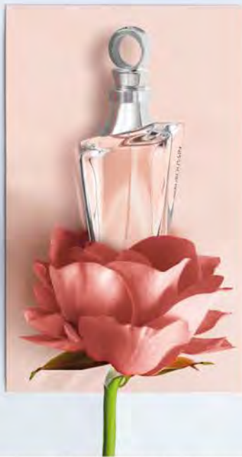
Pour Elle | EAU DE PARFUM POUR FEMME