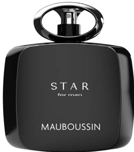
STAR FOR MEN WODDY AMBERY – 90 ML