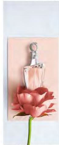
Pour Elle | EAU DE PARFUM POUR FEMME