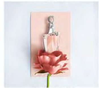
Pour Elle | EAU DE PARFUM POUR FEMME