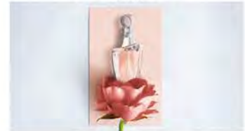
Pour Elle | EAU DE PARFUM POUR FEMME