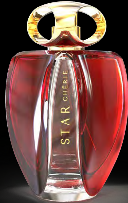
STAR CHÉRIE FLORIENTAL FRUITY GOURMAND – 90 ML